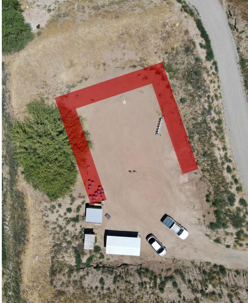
Range 8 Pistol/Rifle Bay is a pistol and rifle caliber range.